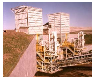
Black Thunder, Wyoming; Semi-Mobile Truck Dump and Crushing Stations

Roberts & Schaefer's structural engineering group serves a key role in Roberts & Schaefer's ability to serve the industrial mining and steel industries both in Utah, the Mountain West, and worldwide.