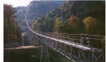
Harris Mine, West Virginia 4-mile long conveyor

Structural design is a major part of each project undertaken at Roberts & Schaefer. Unique